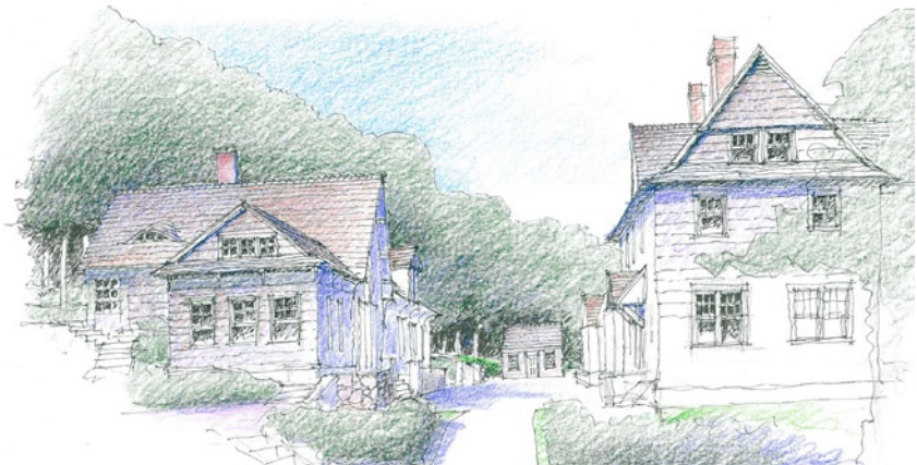
A new landscape courtyard (2) formed by Lehmann Hall on the right and new Visual Arts building