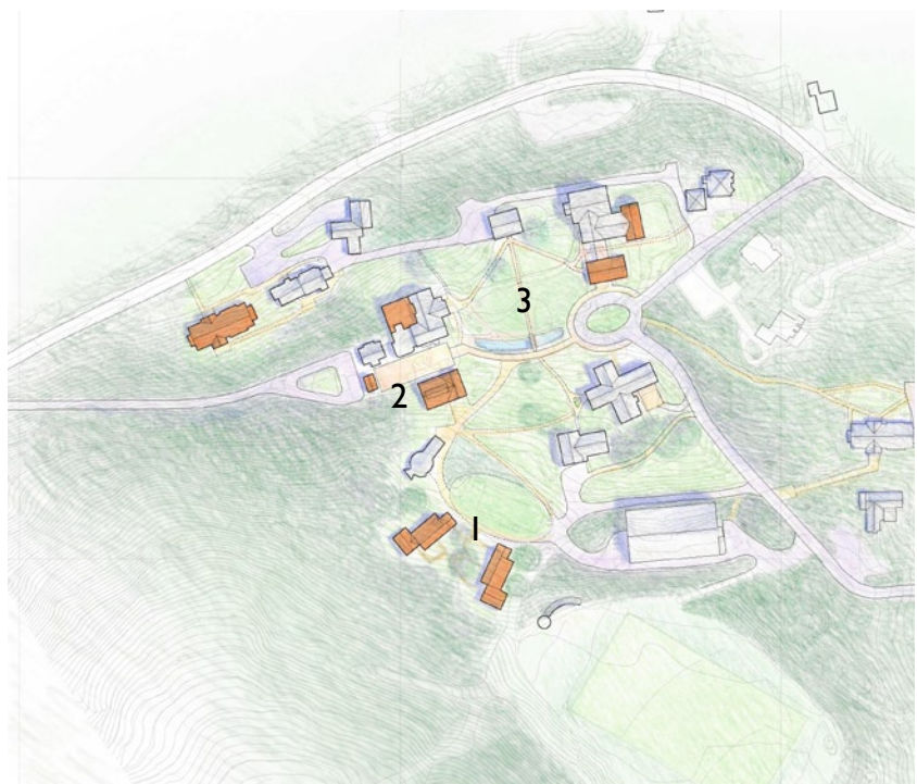
A central green (3) as shown on a portion of the Master Plan with a new crescent path replacing the parking lot and roadway.