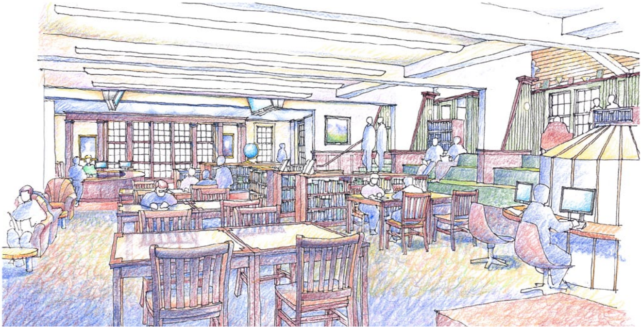
Rendering of New Library