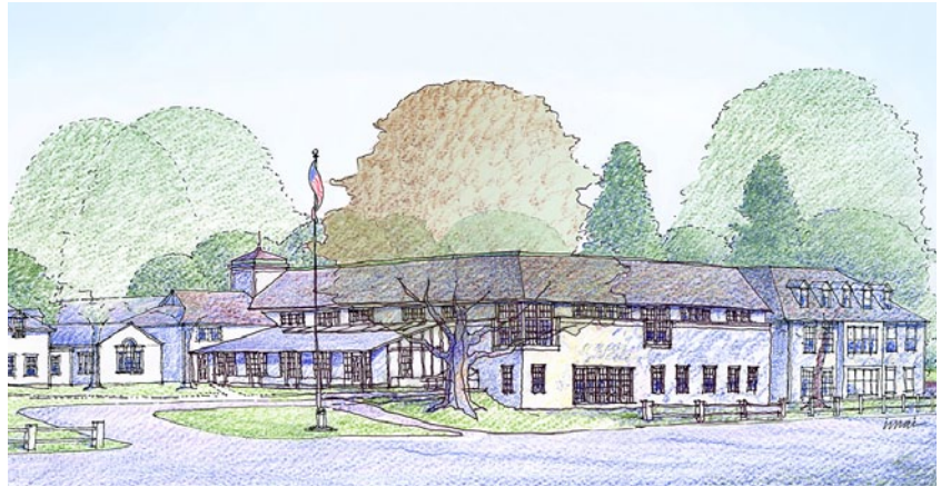
New Library & Science Center

The Library & Science Center project allows Fenn to accomplish two of its long range planning goals; the creation of a new library equipped for 21st century learning and the development of a middle and upper school science center in one building.