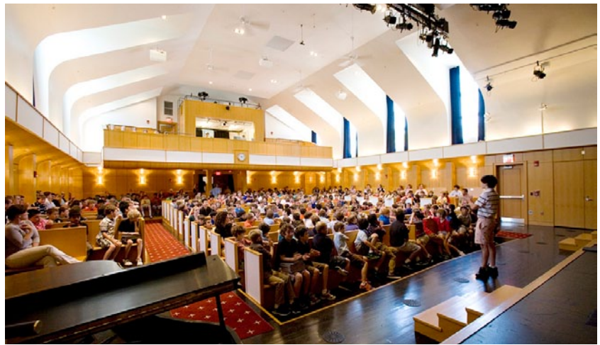
New Meeting and Performance Hall Interior (above) and Exterior (below)